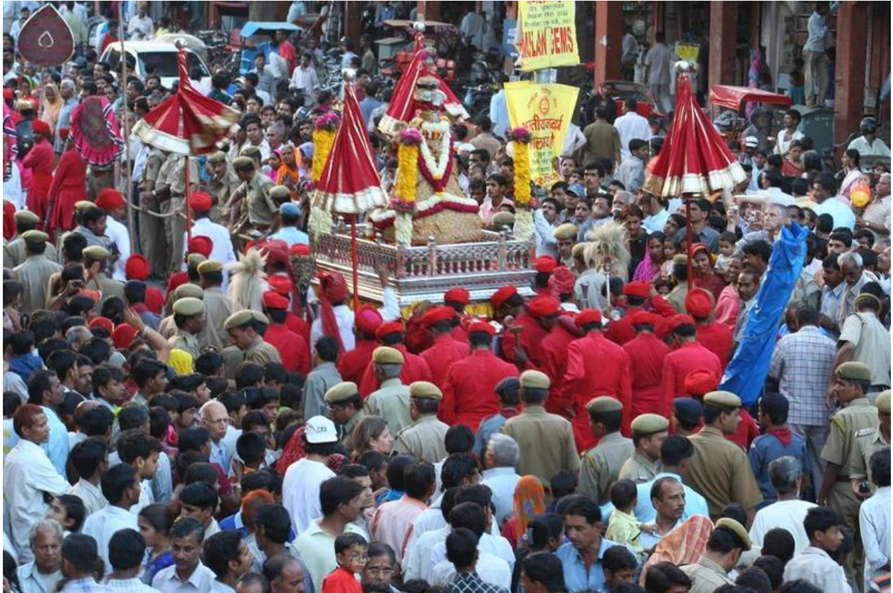
Image of gangaur celebrations retrieved from RAJA website

I added these pictures since we missed RAJA gangaur celebration 2020 due to COVID-19