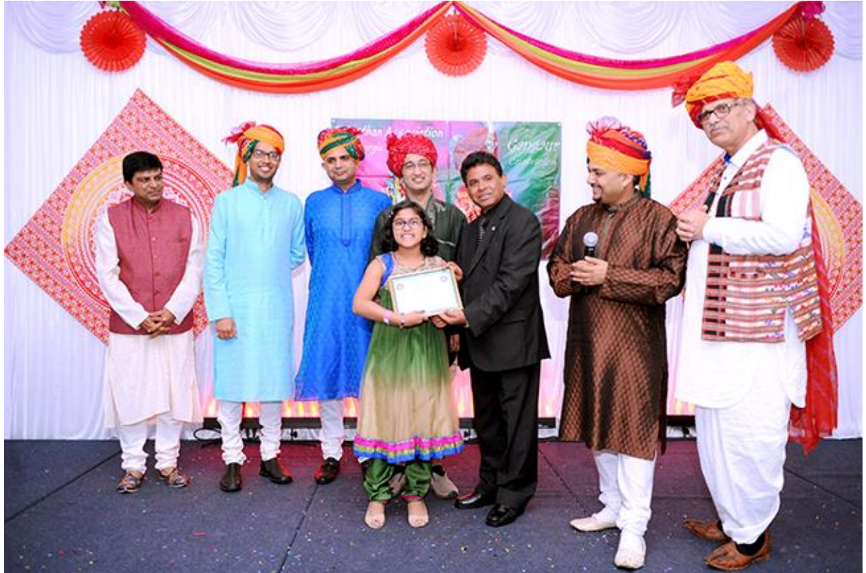
Image of RAJA gangaur celebration